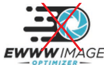
Low Resolution Reproduction