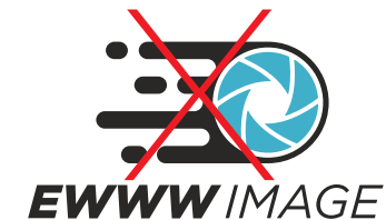
Deletions from Logo