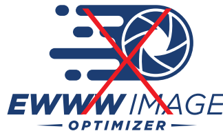
Improper Color Usage