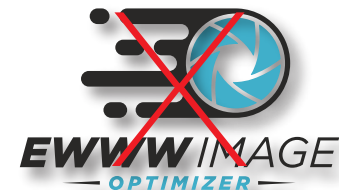
Additions to Logo