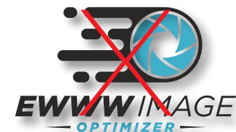
Additions to Logo